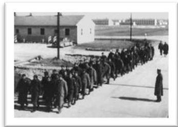
German POWs in Kansas, circa 1944-45

By the end of World War II some 425,000 German, Italian and Japanese prisoners of war (POWs) found themselves imprisoned in over 660 base and branch POW camps in almost all of the then-48 United States and the territory of Alaska. Millions more Axis and Allied POWs were held in other camps in Europe, the Soviet Union, Canada, Australia and Africa. While Axis and Soviet POWs were both the perpetrators as well as victims of dictatorial governments and state-sponsored violence, POW experiences on all sides embody ageless and timely themes of war and peace, justice under arms and issues regarding human rights, international reconciliation and future conflict avoidance.