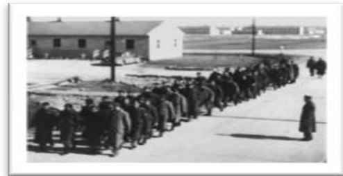
German POWs in Kansas, circa 1944-45

TRACES Center for History and Culture is a Midwest/WWII history museum located in Saint Paul, MN. Each of its more than two dozen exhibits about Midwesterners' encounters with Germans or Austrians between 1933 and 1948 forms part of a larger mosaic, a fuller image of a war that is often misunderstood or seen in clichés. At TRACES, WWII is a case study to learn from for today and future generations.